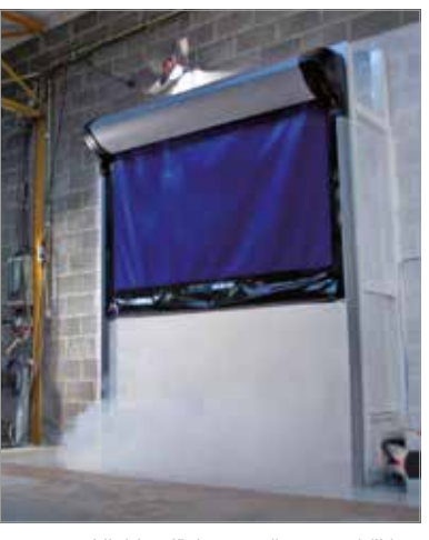
Highly efficient sealing capabilities

The exceptional door seals and fast operating speeds minimise heat loss and save energy.